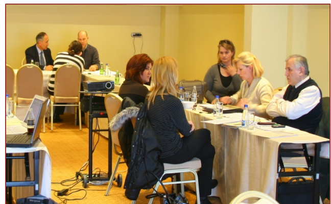
Regional Tourism Steering Committee Meeting Podgorica, December 2011

What was needed was an initiative so appealing and motivating for all stakeholders in the region that they were ready to put all differences aside and unite efforts. It needed to be an opportunity that was of interest to the private sector to ensure real involvement of the industry.