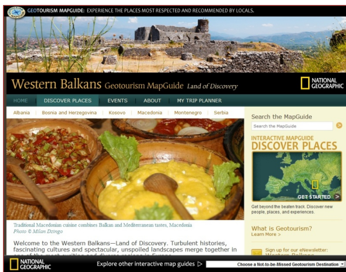
Screenshot from the Home page of the Western Balkans Geotourism MapGuide Portal

become an effective market-access tool for authentic and distinct travel experiences within the region. As all activities involving National Geographic, this program had to be based on the values and mission of the organization. This meant that the MapGuide program naturally facilitated stronger commitment to the principles of sustainability at the regional and country levels. Another important aspect was that the MapGuide featured authentic tourism attractions and small, local tourism service providers who are the true carriers of the local spirit. This